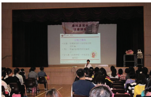
Community Antenatal Talk at Mei Foo

Community Antenatal Talks: Five antenatal talks were held in Tai Po, Mong Kok, Mei Foo and Wan Chai. 1,050 expectant mothers, some were with their families, attended the talks.