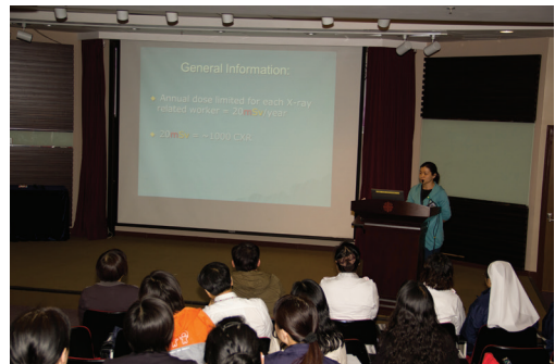
Quality & Safety Presentation Seminar

A Quality and Safety Presentation Seminar was conducted on 26 November 2013. There were 21 Continuous Quality Improvement ("CQI") teams from various departments presenting their CQI projects in the seminar.