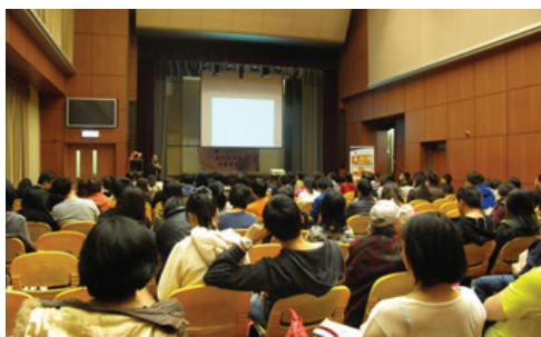
Community Antenatal talk at Mong Kok