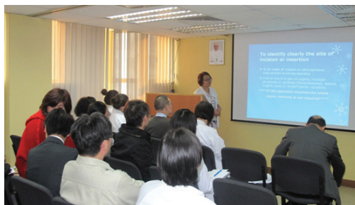
Presentation in the CQI Forum

The first annual CQI Forum was held in December 2013 with all departments shared their achievements in CQI projects. The projects were assessed by an assessment team formed by senior management staff and the best three projects were selected. The activity helped to improve quality services in the Hospital.