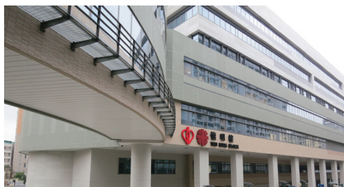
▼ New Wai Ming Block

Most of the user departments had moved into the new Wai Ming Block and commenced services in March 2014. The landscaping and remaining works of the Phase II project would be completed by the 1st quarter of 2015.